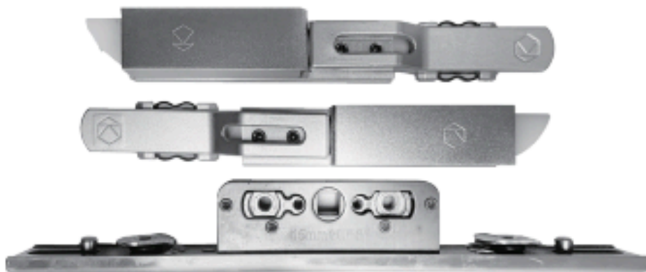
Automatic latch + Transmission box